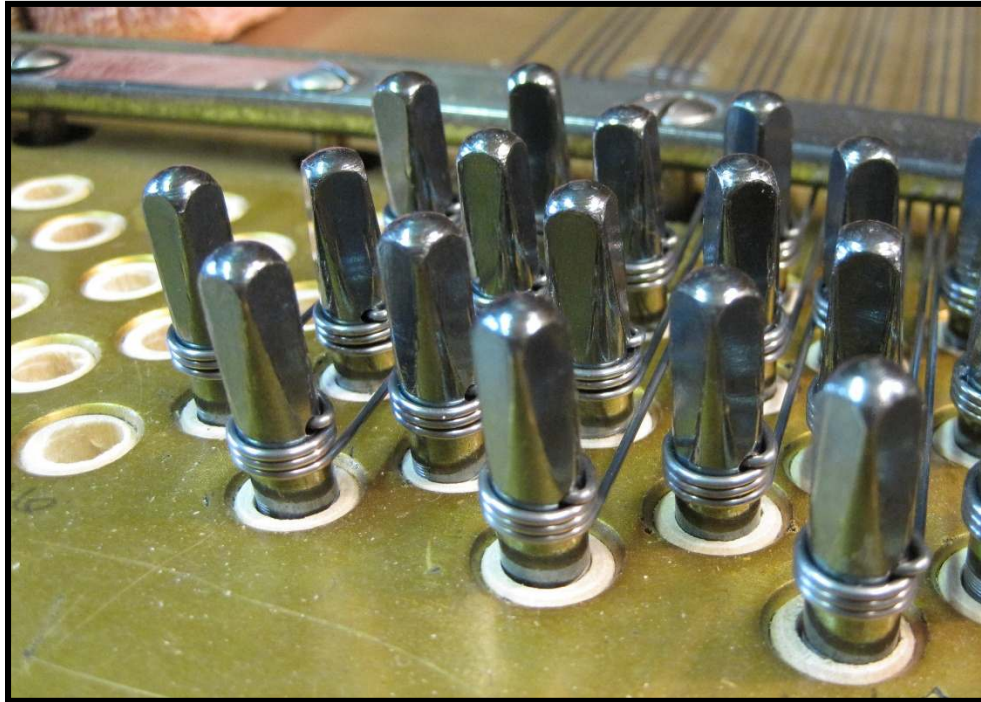
New tuning pins and strings being installed.

For a piano to maintain a stable tuning and sound its best, it is essential that the tuning pins are tight and that the strings are in good condition. When the tuning pins of a piano become loose and tend to slip, the piano will not stay in tune for a reasonable amount of time. When the strings have deteriorated to the point where they are breaking frequently, the tone of the piano will usually suffer as well. Your piano is showing symptoms of problems caused by brittle strings and loose pins which could be lessened or eliminated if your piano were to be repinned and restrung.